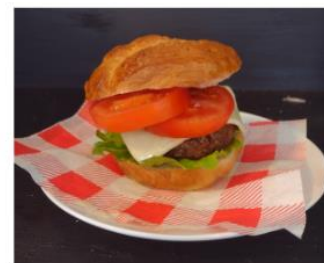
Year 8 Burgers