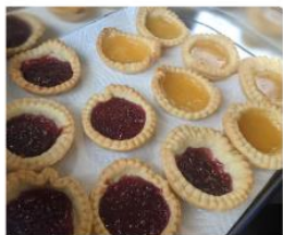
Year 7 jam tarts Shortening - fats practical