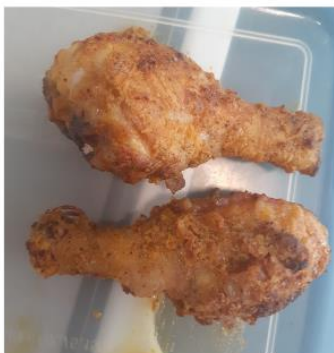
Year 10 Chicken kiev, stuffed breast Fried legs