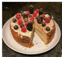
Year 8 Victoria sponge Homework'