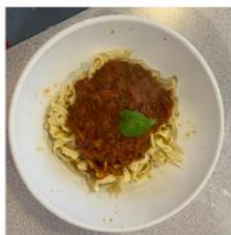
Year 8 homemade tagliatelle and ragu sauce