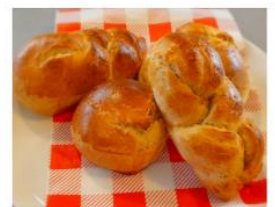
Year 7 bread making