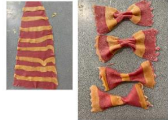
Year 10 Colored pasta making