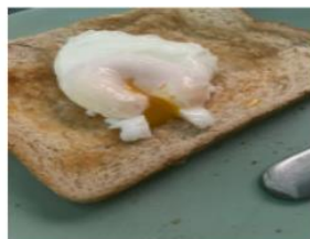
Year 7 'All things eggy Homework'