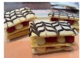
Year 10 Mille Feuille Puff pastry