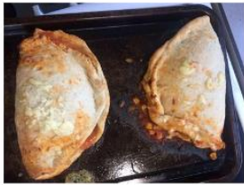
Year 9 Calzone