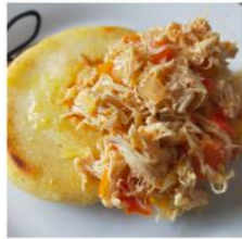
Year 9 World cuisine homework