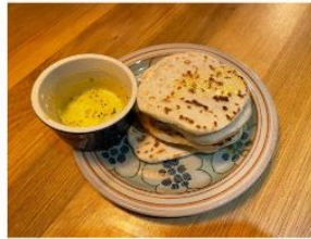
Year 10 Flatbreads