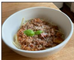
Ola Wolska yr8 Reduction sauce Spaghetti Bolognese

A selection of the fantastic work Gillotts KS3 students are producing at home for their Food lessons.