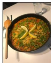
Flo Wakely Year 9 Cooking with rice Paella