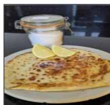
Conal Thompson Year 7 Weighing, measuring and hob use Pancakes